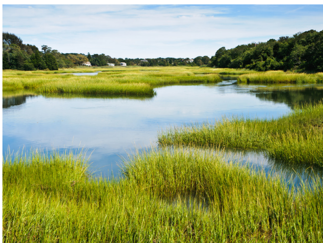
This project will protect, restore, and enhance important intertidal marsh habitat like that pictured above that provides important nursery habitat for many fish and shellfish species.

The Deer River Watershed has been identified as a focal area in the Mobile Bay National Estuary Program's (MBNEP) Comprehensive Conservation and Management Plan, which has designated the project as a target for long-term habitat conservation and restoration.