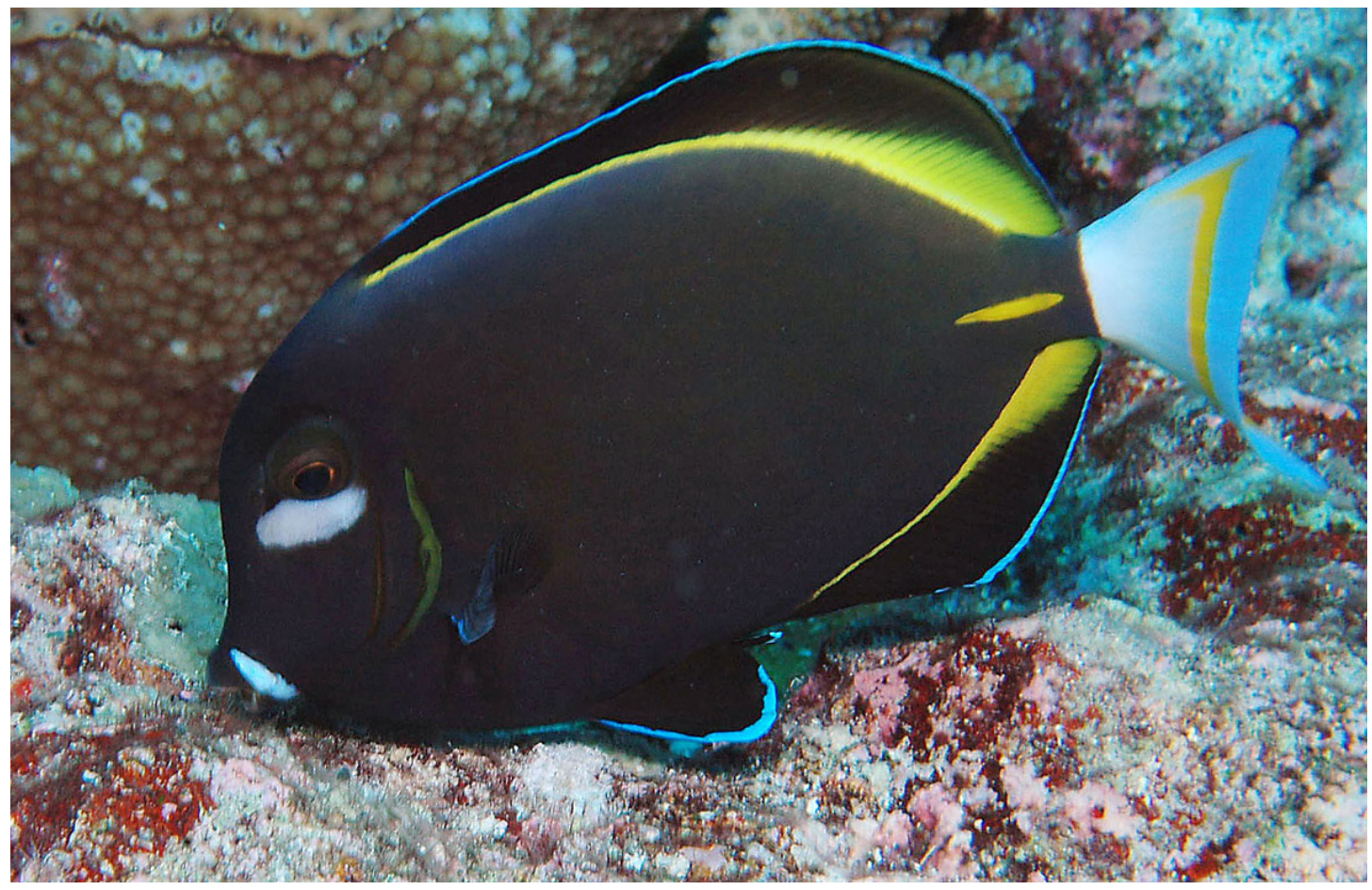
Surgeonfish on a reef in American Samoa

Conservation Program, with additional support from the USDA's Natural Resource Conservation Service and Aramco. In addition to providing a common framework for coral reef conservation strategies and monitoring for NFWF, the Coral Reef Conservation Fund is an incubator for innovation, development, and dissemination of best practices for coral management and threat reduction.