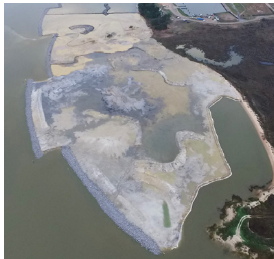
This project will construct shoreline protection structures which will increase coastal habitat and help protect the Bayou La Batre community.

The Bayou La Batre area has been identified in the Mobile Bay National Estuary Program’s (MBNEP) Comprehensive Conservation Management Plan as a priority watershed for long-term conservation and restoration. This project extends an existing 1.2 mile shoreline protection and 30-acre restoration project immediately to the west of the mouth of Bayou La Batre and complements a proposed NRD shoreline protection project at Point Aux Pins.