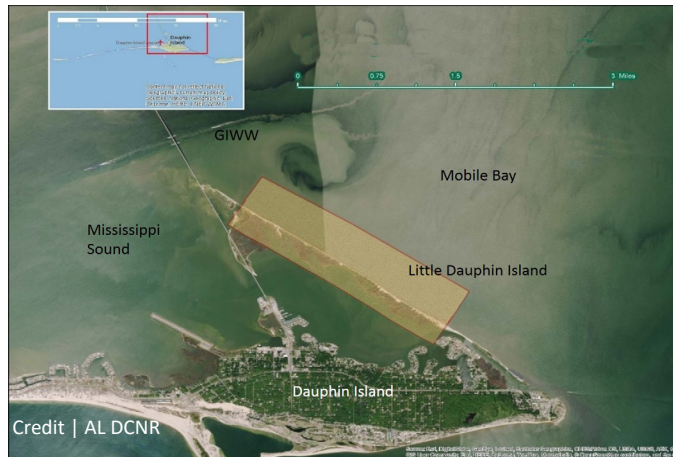
This project will undertake necessary studies to protect and restore Little Dauphin Island, highlighted in the map above.

Little Dauphin Island is a noted nesting and foraging area with high concentrations of colonial and solitary beach nesting birds. This project represents a first phase in ongoing efforts to restore Little Dauphin Island and ensure its continued ecological function in the Dauphin Island and Mobile Bay complex.