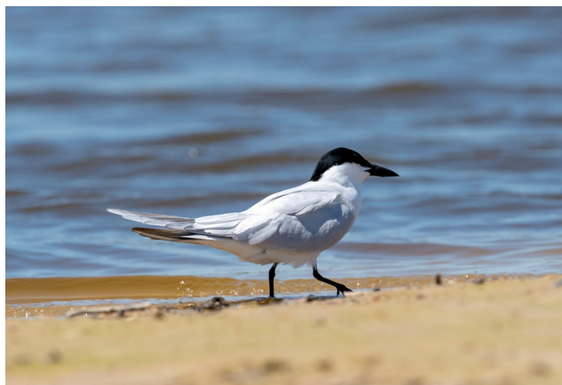
This project will restore and protect the feeding area of various bird species, like the gull-billed tern pictured above.

These projects and earlier GEBF investments are a part of a larger, multi-year effort to establish a restored hydrologic connection between the Bahia Grande wetland system and the Laguna Madre that was interrupted in the 1930's and 1950's. For nearly 70 years, the degraded wetland was a source of blowing dust, a site of massive fish kills, and a complicated natural resource problem. A suite of projects funded by NRDA, RESTORE and other funding programs, as well as NFWF, are building towards the goal of restoring over 10,000 acres of critical wetland and shallow water habitat for wildlife and fisheries, making it one of the largest estuary restoration projects in North America.