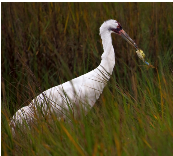
This project will protect marsh habitat and the various bird species that rely on the habitat, such as the whooping crane (right).

The findings and designs that result from this project will be incorporated within a master effort to enhance, restore and protect nearly 10 miles of shoreline and the newest coastal WMA and Park in the Texas system – Powderhorn Ranch. This comprehensive vision for this area is a high priority within the Texas Coastal Resilience Master Plan, which is slated for implementation funding from various sources, e.g. NRDA, GOMESA, and the Texas Coastal Erosion Planning and Response Act (CEPRA).