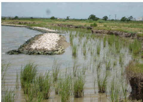
This project protected and restored coastal wetlands, prairies, and other important habitats within the Virginia Point Preserve.