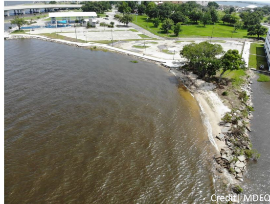
This project would support shoreline protection and benthic habitat creation at Point Cadet in the mouth of Back Bay of Biloxi, shown in the above left map, with the existing condition pictured in the above right.