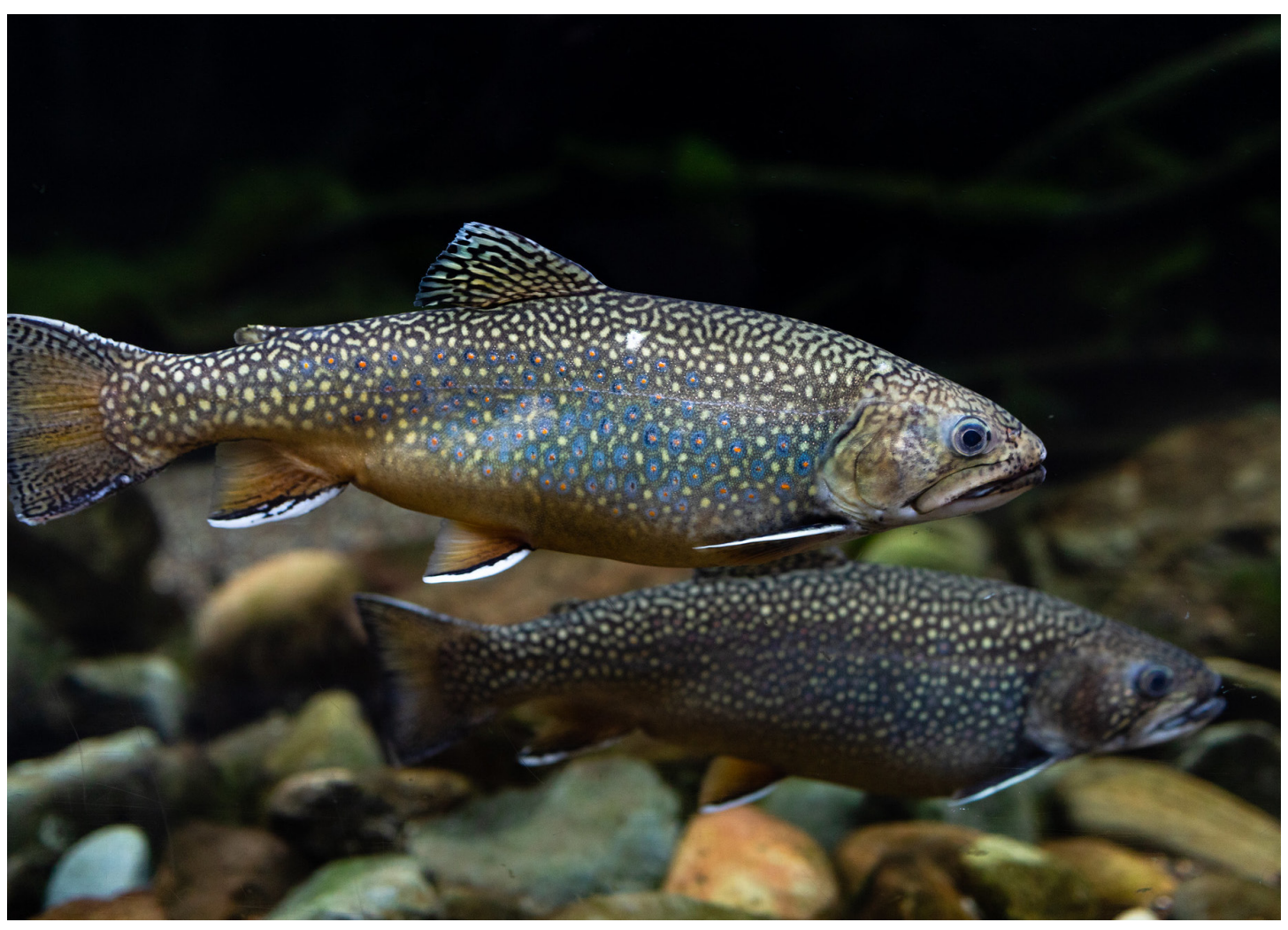
Eastern brook trout