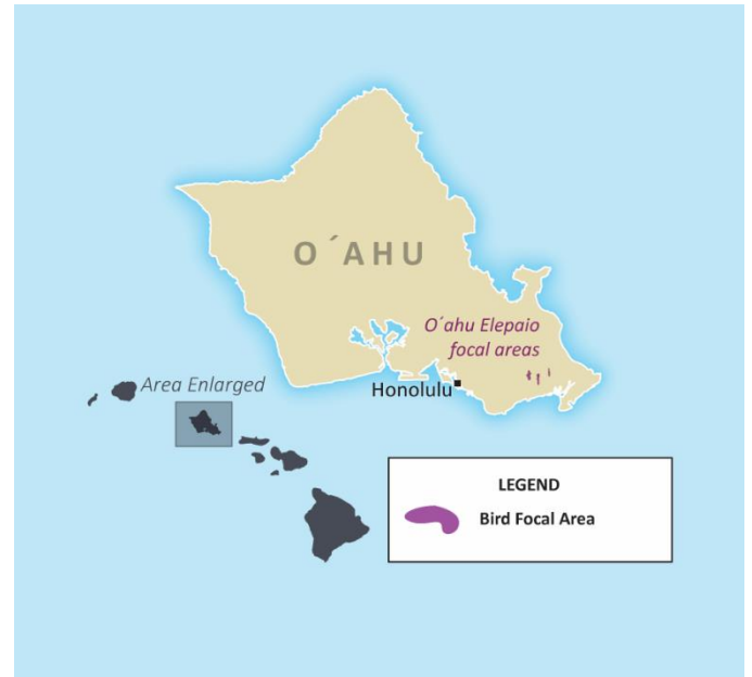
Map 4: Priority Geography for O'ahu.