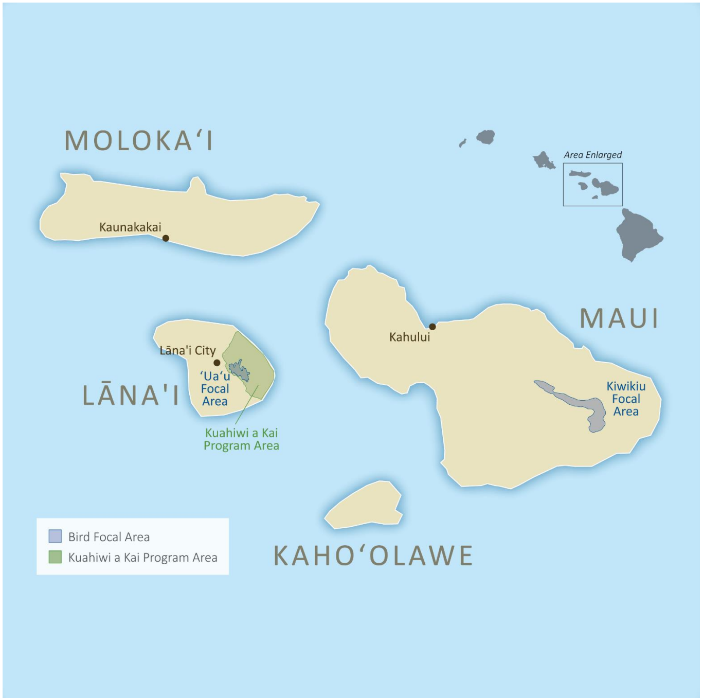
Map 2: Priority Geography for Maui Nui.