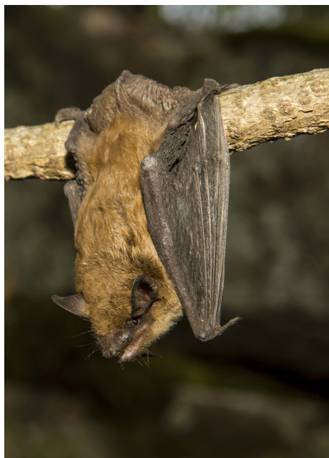
Big brown bat