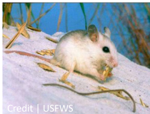
Coastal dunes under threat of residential development are now protected by this acquisition. This is critical habitat for the endangered Alabama beach mouse, pictured above.