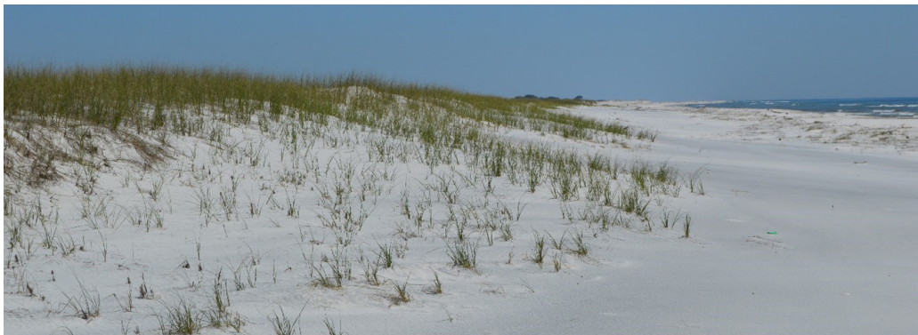
This project will benefit habitat like Horn Island shown above and provide suitable habitat for beach nesting birds.

The scope of work for Phase II also includes continued prescribed burns on portions of the GUIS that are on the mainland (Davis Bayou). In total, NPS seeks to treat over 360 acres to enhance the ecological integrity and improve water quality in the bayou.