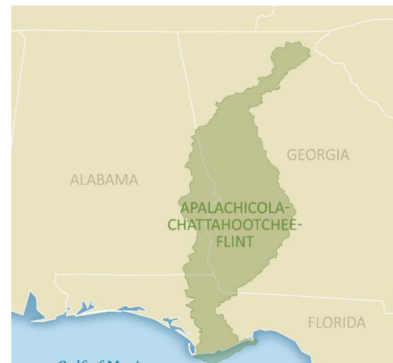
Figure 3: Southeast Aquatics Fund Geographic Focal Area 2