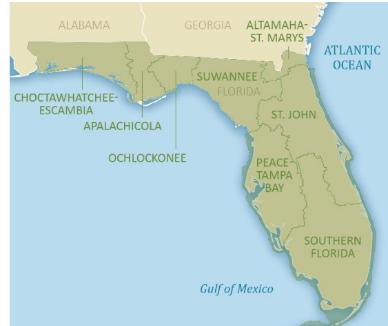
Figure 4: Southeast Aquatics Fund Geographic Focal Area 3

Projects will be considered that provide outreach and technical assistance to farmers and ranchers to increase access to and implementation of NRCS Farm Bill and other cost-share programs that support implementation of prescribed/rotational grazing and associated practices within cattle-producing counties across Florida. Projects should benefit freshwater aquatic species populations and help improve soil health conditions to have a positive carbon sequestration benefit. Projects may include financial cost-share assistance for implementation of prescribed/rotational grazing and associated practices that fills strategic gaps in existing federal, state, and local cost-share and incentive programs. Please see Program Priorities below for additional guidance. Applications within this geography should identify the counties in Florida where project activities will be focused.