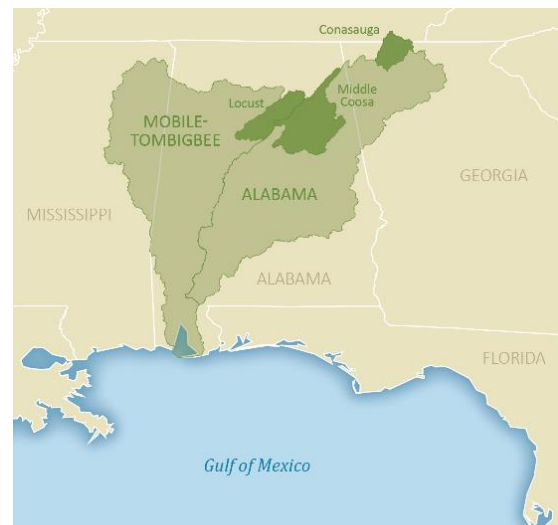
Figure 2: Southeast Aquatics Fund Geographic Focal Area 1

Projects will be considered that support sufficient water flows for native freshwater species, with particular interest in projects associated with agricultural lands (Figure 3).