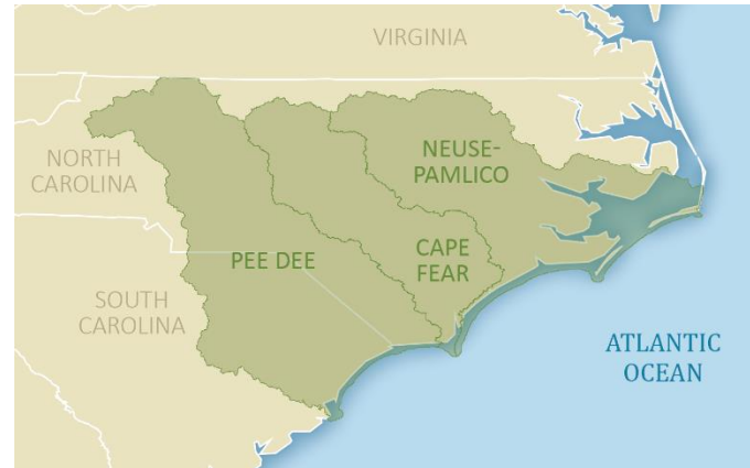
Figure 5: Southeast Aquatics Fund Geographic Focal Area 4

Projects will be considered that support improved soil health practices and carbon benefits on agricultural lands that advance watershed health to benefit freshwater aquatic species populations within the Neuse-Pamlico, Cape Fear and Pee Dee River Basins (Figure 4). Projects may include providing technical assistance or financial cost-share assistance for practice implementation to strategically fill gaps in existing federal, state, and local landowner conservation cost-share and incentive programs. Please see Program Priorities below for additional guidance. Applications within this geography should identify the counties where project activities will be focused.