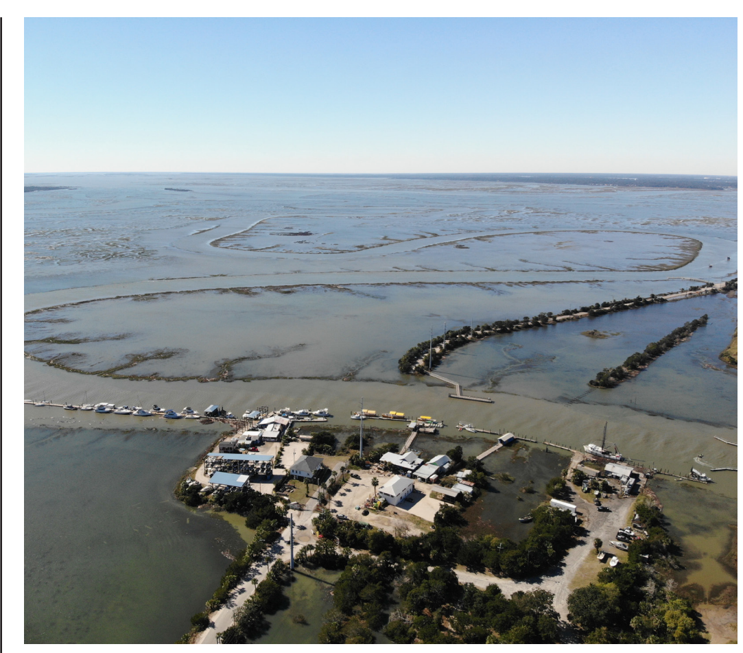
Wetland in Georgia

1133 15th Street, NW Suite 1000 Washington, D.C., 20005 202-857-0166