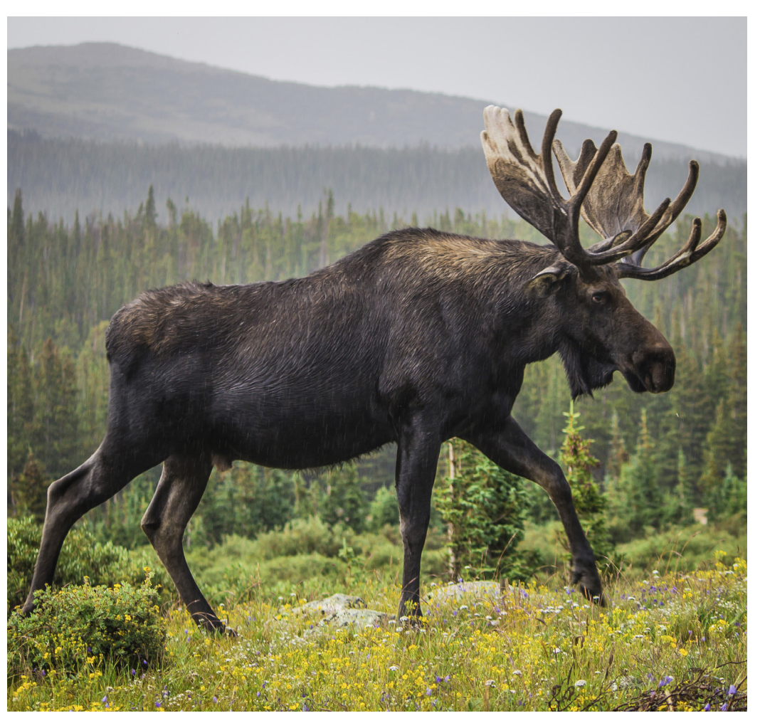
Bull moose in Colorado

1625 Eye Street, NW Suite 300 Washington, D.C., 20006 202-857-0166