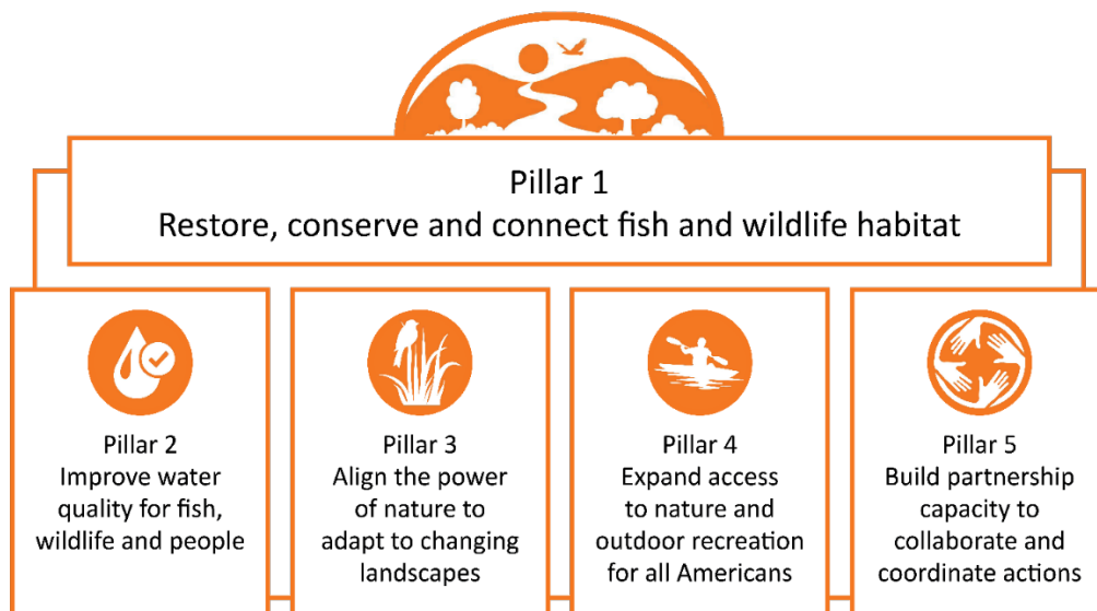
Figure 1 Chesapeake WILD Program Pillars

All proposals must clearly address how projects will directly and measurably contribute to the accomplishment of one or more Chesapeake WILD Program Pillars described below. At a minimum, all proposals must address Pillar 1: Fish and Wildlife Habitat .