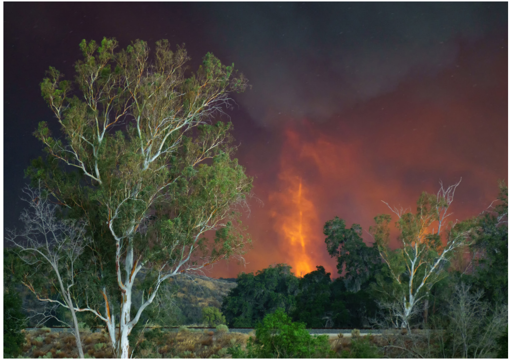
Forest fire, Angeles National Forest