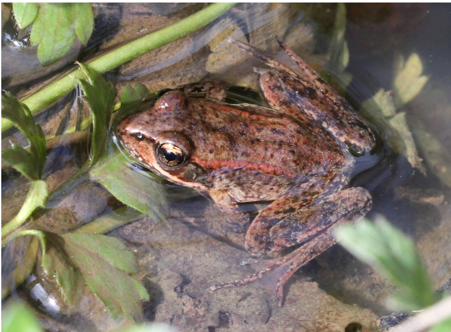
California red-legged frog

in the Copper, Ranch and Sayre Fire areas to assess the adequacy and effectiveness of road Best Management Practices, identify sedimentation sources impacting aquatic habitat, and evaluate the condition of culverts and other road infrastructure. The project will reveal restoration opportunities that will benefit aquatic habitat and improve future firefighting efforts by identifying road safety and integrity issues in the Angeles National Forest road network.