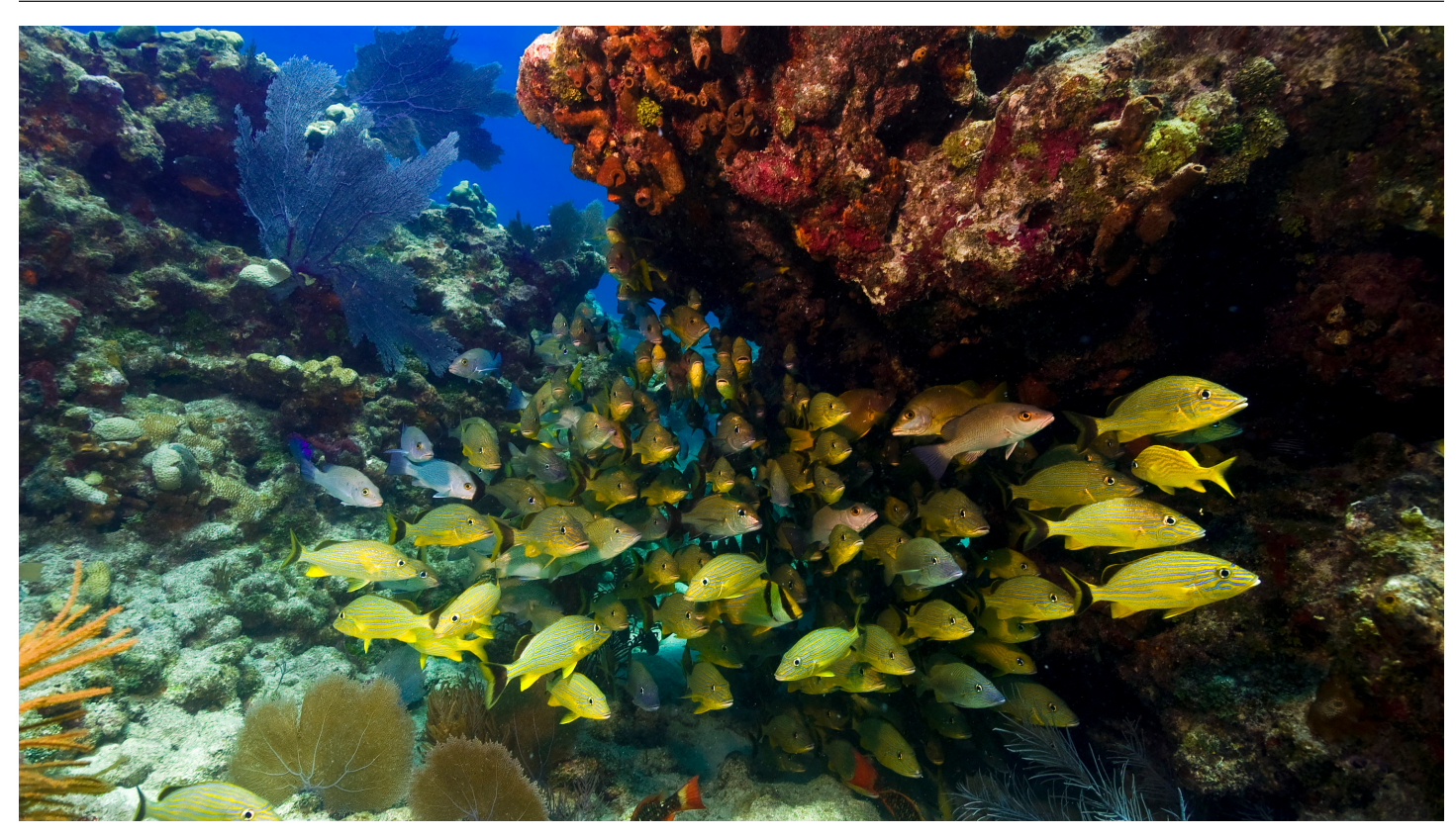
Coral, Florida Keys