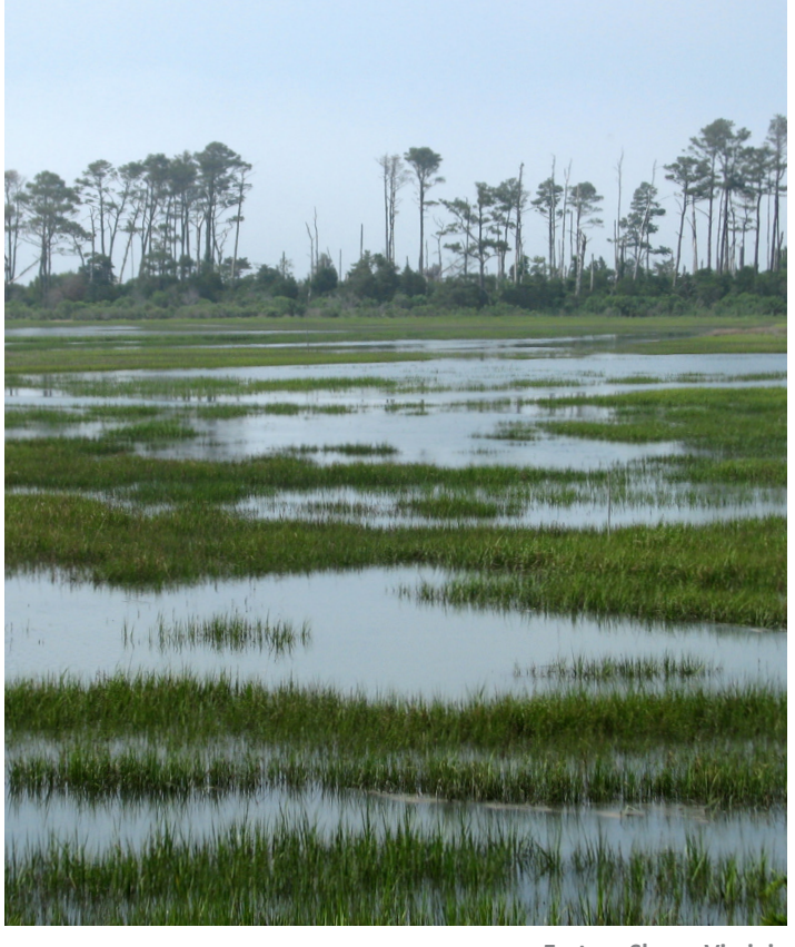
Eastern Shore, Virginia

Design a hybrid living shoreline breakwater to minimize further erosion of a peninsula on the west side of the Maurice River and plan the protection and restoration of a second vulnerable location on the east side of the river. Project will develop engineered designs, construction methods, permits and cost estimates in preparation for wetland restoration construction.