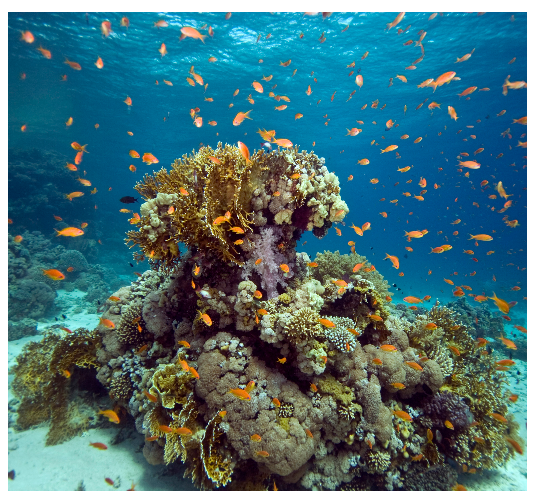
Coral reef. Hawaii

1133 15th Street NW Suite 1000 Washington, DC 20005 202-857-0166