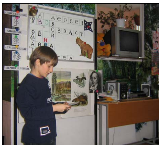
Lesson “Forest as an eco-system”

On December 08, the educator arranged a meeting with biology teachers of Novopokrovka town, Novokreschenka, Lukyanovka, Gogolevka villages at the eco-centre and told them about new visual materials, showed new books, explained how to work with disks and work plans for 2007.