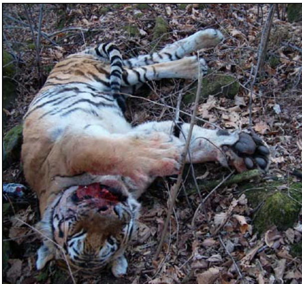
Killed tiger, November 15, 2006

The cub is about 4-6 months old. It is very weak and has dull hair and hollow sides. It had a graze on its neck, broken canine, running eyes and practically could not move. The animal was transported to the Far Eastern Zoo for urgent medical care until the decision is made where it would follow a rehabilitation period. Inspection Tiger officers examined the place of the accident to clear out what had happened.