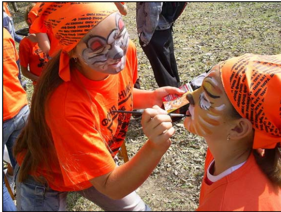
Tiger face painting

and prey, severe logging and degradation of the habitat, as well as conflict tiger situations with local people. Many of the damaging human activities result from ecological ignorance of local