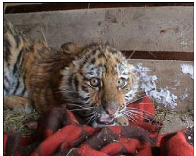
Rescued tiger cub

On November 25, during a patrol in Mataisky wildlife refuge in the Khima-2 River drainage the rangers found an unregistered hunting rifle near a logging camp. The weapon was confiscated and forwarded to the police department of Lazo district.