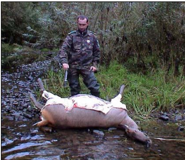
Ranger found a poached deer

The Khabarovsky anti-poaching team of Inspection Tiger consists of three experienced rangers and covers southern part of Khabarovsky region and northern border of the tiger habitat. The team has showed one of the best anti-poaching results in Inspection Tiger. For the reported period the team drew up 53 reports on violations of hunting regulations, revealed 21 violations of fishing regulations, confiscated 25 illegal rifles, 55 fishing nets and investigated conflict tiger cases (see Table 1). See the description and results of the project activities for the period from January 01 to September 31 in the Interim Report.