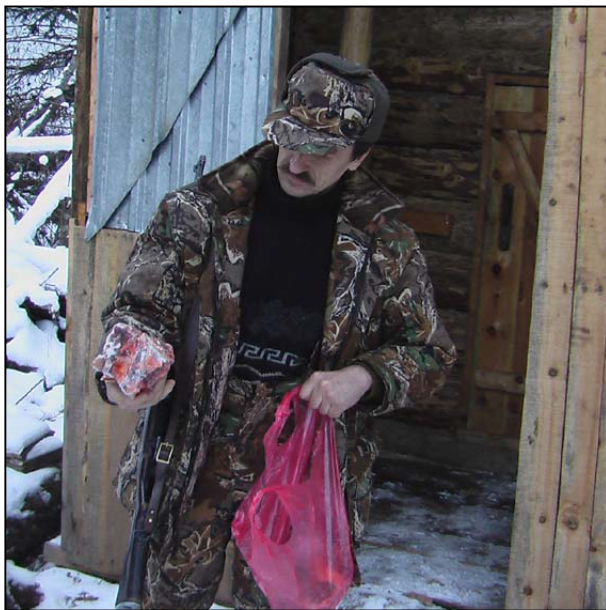
Ranger found meat of poached wild boar

On October 18, while patrolling in cooperation with a ranger of Hunting Management Department in the hunting grounds of "Alchan" Ltd. 7 km far from Zvenyevaya village near Funtasu natural landmark the public rangers heard two gun shots. Walking to the place of the accident they met a man with a gun, dweller of Bikin town. He hunted hazel-grouses without license. The officers made a report on the detainee and imposed a fine on him.