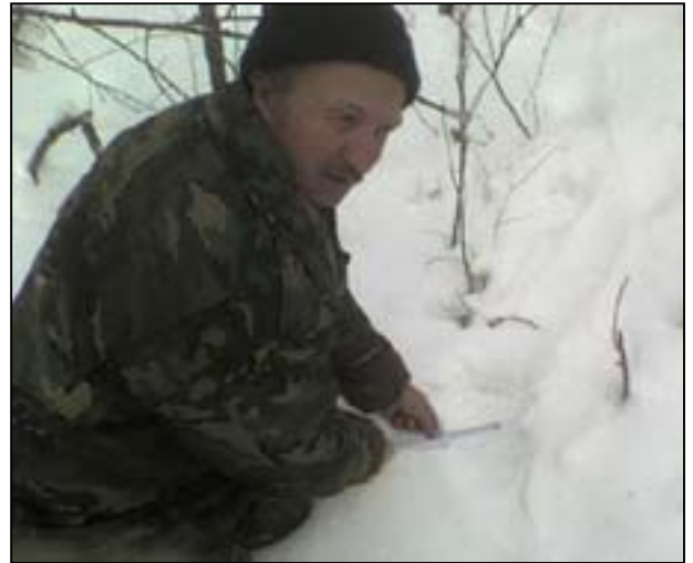
Measuring tiger tracks

ITA-32 - On October 26, the rangers received a message from a wildlife manager of Primorsky Department of Federal Service for Veterinarian and Vegetation Sanitary Supervision in Terneisky district. According to him, at night on October 24-25 a young tiger tried to catch dogs on a logging lot 20 km far from Terney town. The wildlife manager went to the place and determined that it was a cub left by its mother for some reason and unprepared yet to live on its own. The dog owners usually do not shut or tie their dogs at the camp. Being in the forest with dogs equals hunting. On October 27, the wildlife manager was going to visit the lot again. Inspection Tiger rangers asked him to pass their request to loggers to remove all the dogs till the tiger leaves the area in order not to aggravate the situation. No repeated messages came from Terney.