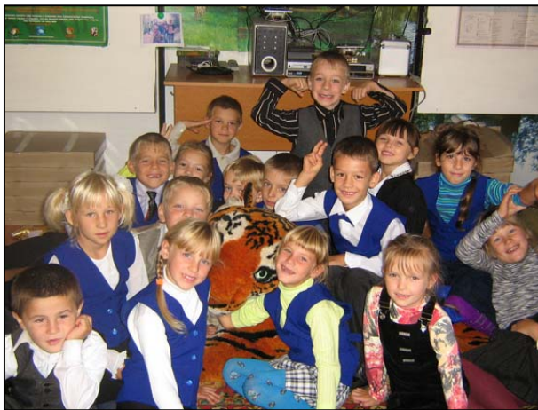
Children at the tiger eco-centre

In January 2004 the Phoenix Fund offset up the Tiger eco-centre in Novopokrovka town, Northern Primorye. The city authorities provided a classroom for the centre at a local school and an experienced educator conducts ecological classes, lectures, slide presentations and other activities for children and adults. The classes have been hugely successful and have attracted 2,500 children from around this vast region. For the reported period the teacher carried out over 180 eco-classes and over 2,940 children visited the eco-centre regularly. See the description and results of the project activities for the period from January 01 to September 30, 2006 in the Interim and Programmatic Reports.