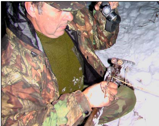
Ranger found a rifle hidden in snow

On November 29, the joint team decided to check the obtained information on illegal logging near the Markelov spring. When the team was 3 km far from a winter cabin a huge fallen birch barred the way. Having examined the tree the rangers came to conclusion that it had been felled earlier in the morning. They decided to track the footprints leading from the tree to the winter cabin. When the officers reached the cabin, they saw 27 felled trees of various species barring the way. There were three dogs on the leash near the cabin. A local of Melnichnoye village was inside. He told that he barred the way with trees in order to eliminate intrusion into his hunting grounds. As a result, the rangers drew up a report on violation of the Forest Code of the Russian Federation. Later on, the rangers continued