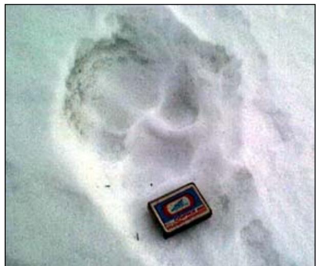
Tiger tracks

On November 29, the team continued tracking a tiger and came to a conclusion that it