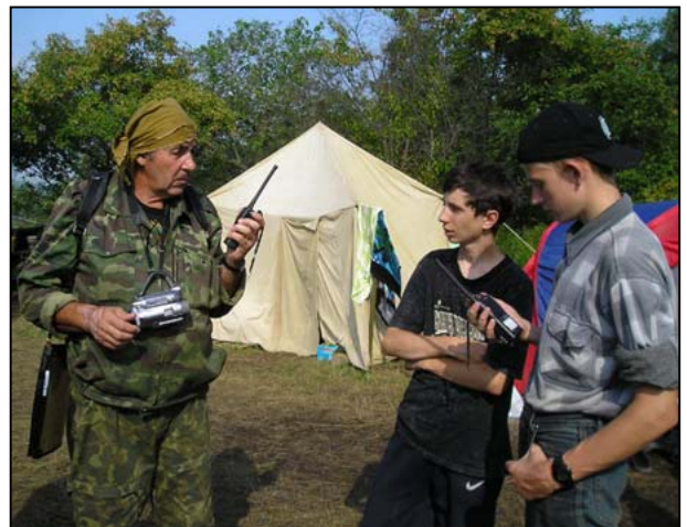
© Phoenix Fund Training "Work with portable radio stations"

The senior pupils were involved in organizing the camp: setting tents, building facilities, chopping firewood and setting fire. Special orienteering trainings were given for the junior pupils. The children learnt to orient themselves using map, compass and different signs and characters. During the trainings the children drew a map of a particular area, and used it playing the game "Find treasure!" After the course "Survival