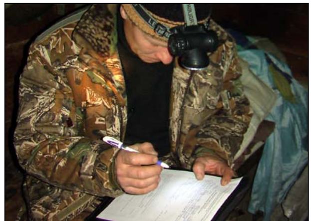
Drawing up a report on violation