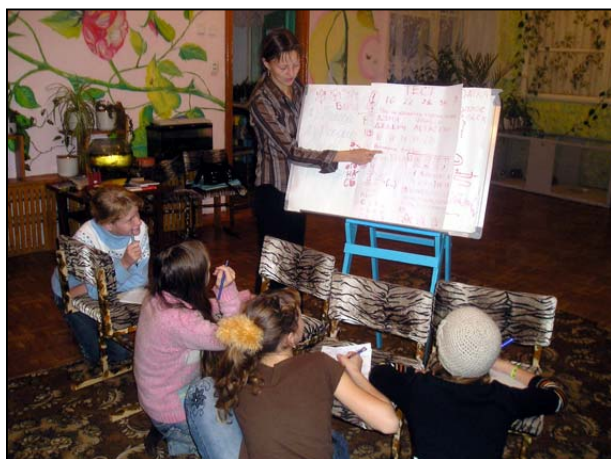
Eco-lesson in Luchegorsk city

On November 02, nineteen pupils of “Robinsons” eco-team participated in an eco-lesson and watched a film “Tiger Odyssey”.