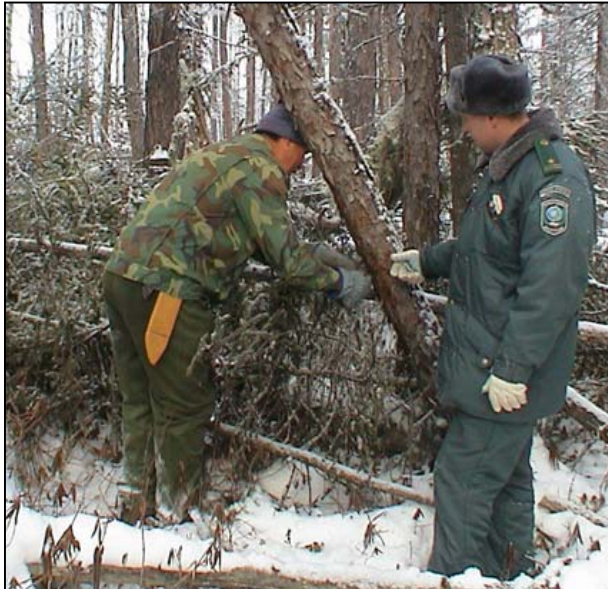
Chinese violator removes snares