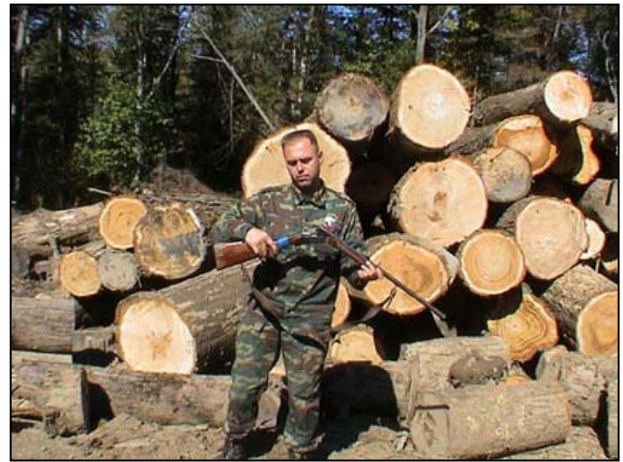
Checking rifles at logging site