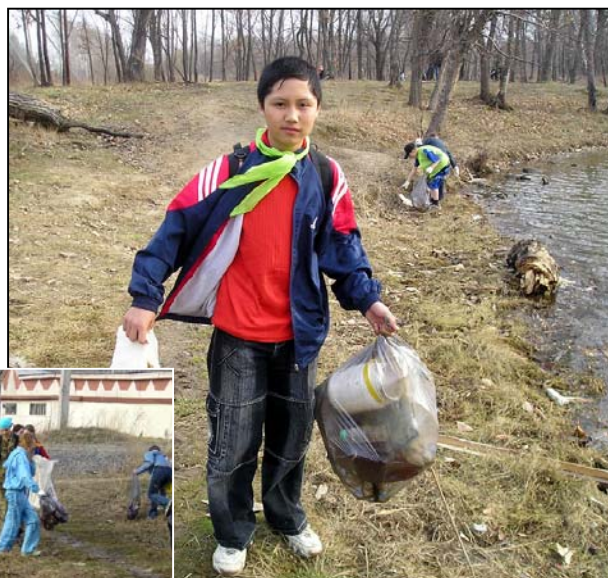
"Clean ponds" action

On May 20 the educator and 50 schoolchildren from "Vesnyanka", "Nezabudka" and "Robinsons" ecological clubs carried out "Clean ponds" action. The main purpose of that action was to gather garbage and clean the territory around the ponds in Luchegorsk city. While cleaning the ponds' shores the children discussed with the educator negative impact of the garbage on the environment. As a result, the children gathered 300 kg of garbage, that was later taken to the city's scrap heap. Besides, they took out a lot of bulky rubbish from the ponds.