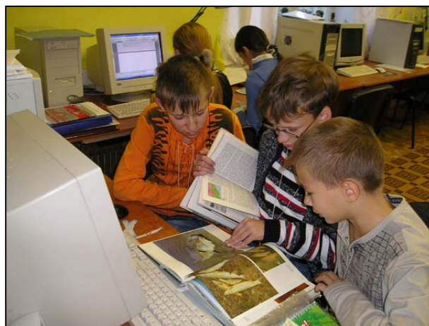
© Phoenix Fund Lesson “Nature reserves of Primorye”

In November, eight pupils of the 6-7 th grades, members of “Robinsons” eco-group, worked on slide presentations for ecological lessons on the following topics: “Nature Reserves of Primorye”, “Relict plants of Primorsky region”, “Big felines”, “Useful plants”, “Korean pine is a life-giving tree”.