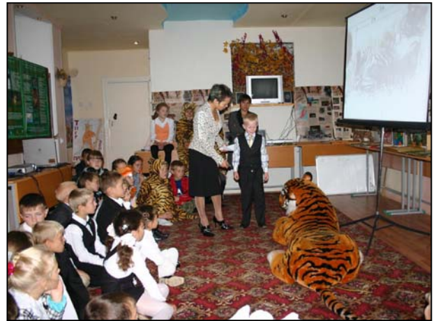
Eco-class on Amur tiger

On July 28 the educator told how indigenous people treat tiger, explained why they worship and are afraid of it.