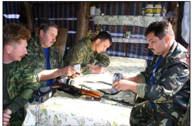
The rangers draw up a report

On July 13 the team conducted an examination of the saw mill and storehouse that belonged to Terneylesstroy Ltd. and revealed the following violations: lack of the state ecological assessment for construction of the saw-mill and the houses, violation of forest fire prevention regulations etc. The rangers drew up reports on violations and will conduct an additional check-up there.