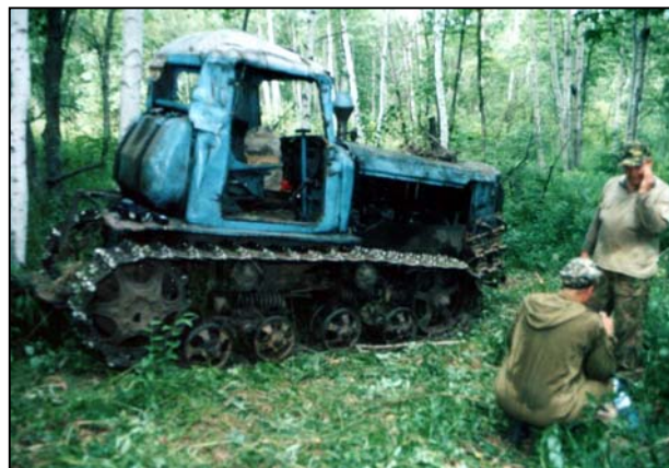
The team found abandoned tractor

On July 08, the Forest team received information that a person was transporting illegal logs (101 logs in total) from the logging camp. During examination of the logging camp the rangers revealed violations of the forest fire prevention regulations and hunting regulations. Having drawn up reports on violations the rangers confiscated the rifle and are going to continue checking the logging camp from time to time in the future.