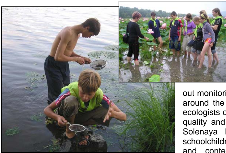
The children conduct research into fresh water quality

The main purpose of the camp was to educate the youth about the forest and its inhabitants, strengthen the knowledge on close relations between man and wildlife and involve children in conservation activities. The camp was set close to Solenaya Pad Lake. The children carried out monitoring of lotus* and patrolling the area around the lake. During the camp the young ecologists conducted research into fresh water quality and purity of the air in the vicinity of Solenaya Pad Lake. Conservationists and schoolchildren participated in special trainings and contests. For example, the contest “Ecological fairy tale” presupposed to tell or stage a famous fairy tale, emphasizing its ecological content. The most popular game