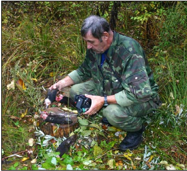
Public ranger found legs of poached wild boar

together with wildlife managers, arrested two men for poaching. The rangers drew up two reports on violation of hunting regulations and imposed a fine.