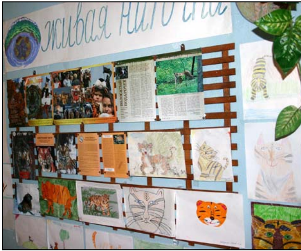
Children's paintings

from fires. From August 14 to August 17 the educator and 12 children visited Sikhote-Alin nature reserve (see Outdoor educational activities). From August 29 the children started preparing for the Tiger Day Festival.