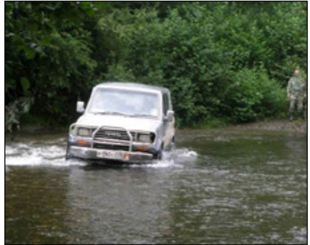
Investigation of conflict tiger case in Khasan

In July 5 conflict tiger cases were investigated.