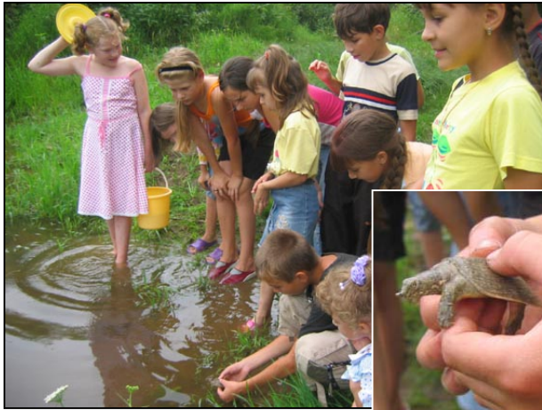
The children release Far Eastern soft-shell turtles into the river

On July 11 the educator told about illegal hunting and how poaching influences tiger's fate.