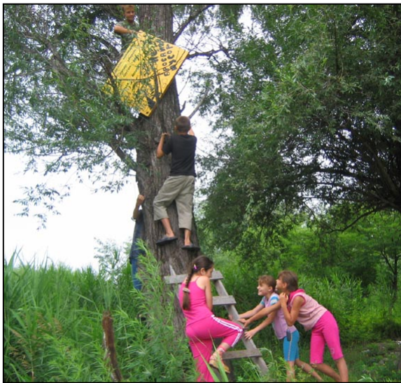
The children set up the warning sign

In January 2004 the Phoenix Fund created Tiger eco-center in Novopokrovka town, Northern Primorye. Thanks to support from Save the Tiger Fund, 21 st Century Tiger and David Shepherd Wildlife Foundation the center became popular place among local children. However, it took several months to repair a classroom (45 m 2 ) for the center in the building of secondary school and only on October 08, 2004 the eco-center was officially opened. Krasnoarmeisky Department of Education presented 10 new school desks to the eco-center. Now, there are many special books, magazines and video films on Amur tiger and other endangered species, a lot of children’s paintings and handicrafts are exhibited in the center. Since April 2005 the educator has been giving eco-classes for the children in Tiger eco-center every day. See the description and results of the project activities’ for the period from January 01 to June 30 in the Interim Report.