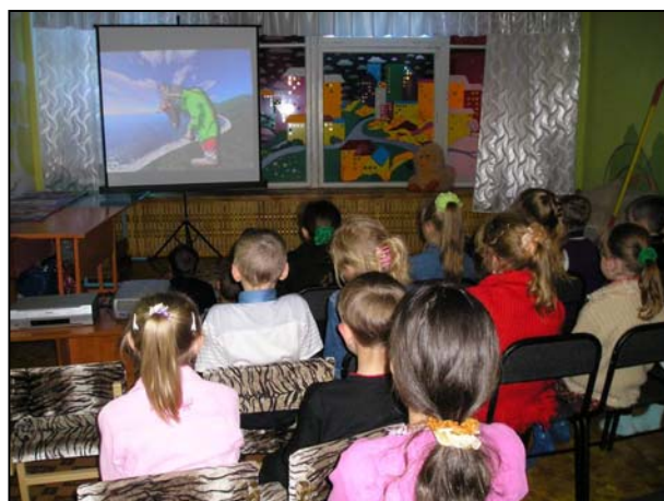
Children watch a film on ecological theme

primeval coniferous forest had been in Pozharsky district. But after the years of merciless land use and uncontrolled logging the forest has changed. There is only underwood now. The forestries protect the forest from poachers and fires and reforest the region. The forestries used to reforest 500 ha every year, but now they cover only 100 ha per year. The teacher told about precious trees that one could find in the forest of Pozharsky district.