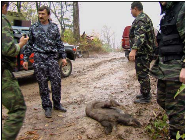
The rangers found a wild boar's skin

In August the team carried out over 8 patrols to reveal illegal hunting, but did not find any violations. Pouring rain made roads impassable and reduced poaching for a short period of time.