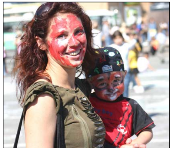
Happy “tiger” family

Organizers made a welcoming speech on the Vladivostok Central Square. Then different folk and modern dances, theatrical and musical performances, prepared by the local artists and children, were carried out on a stage of the Central Square. During the festival there were different contests, quizzes and games. The winners received special awards, including T-shirts, tiger photos, toys, books, magnets etc.