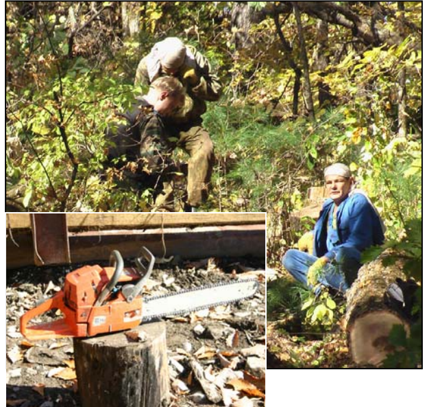
Arrested illegal logger (background) and confiscated chain saw (foreground)

was carried out by 7 men. During examination of the site the team found tractor, car, crane, chain-saw, rifles and bullets. A closer examination of the car revealed that last figure in the identification number of the carriage was changed from 2 to 6. The team also found cedar logs in the camp. The rangers drew up reports on violations, confiscated the vehicles, equipment and rifles and detained 7 men who were later conveyed to police department in Roschino village.