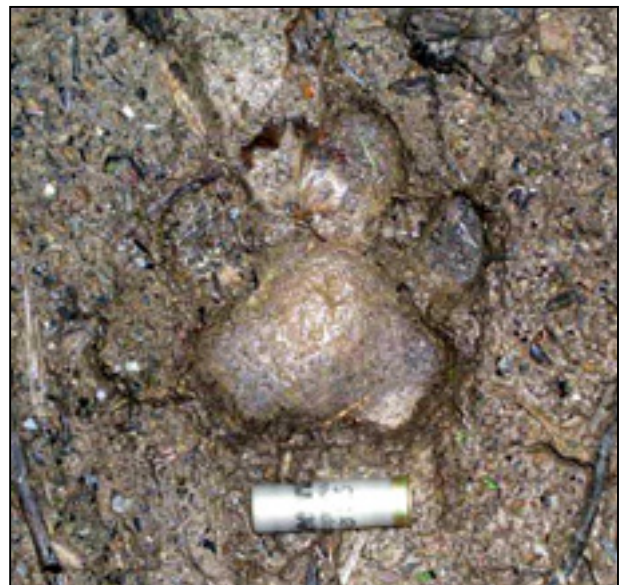
A tiger track

On August 04 – 12 a tiger (11 cm paw width) killed three dogs on the territory of “YPPI” Ltd. (on the logging storehouse in Roschino village, Krasnoarmeisky district. Upon arrival on the scene the Conflict tiger team checked the territory and found tiger tracks (11 cm paw width) 200 meters far from the logging storehouse. Information on the tiger attack was confirmed. The rangers took deterrent measures, patrolled around the village round the clock and instructed the villagers on rules for livestock management in tiger habitat.