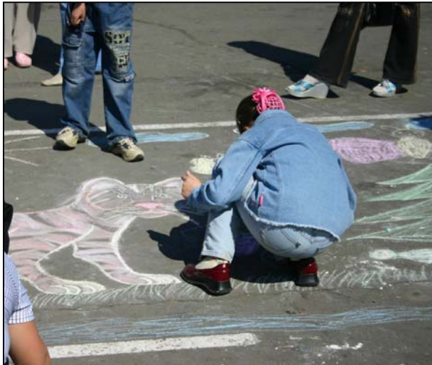
The children are drawing tigers on asphalt

appeal to save Amur tiger population from extinction. Standing next to the tiger posters the children- volunteers told people about tiger biology. A lady in tiger costume treated all participants to special “tiger food”. The winners of the contests were awarded with memorable prizes.