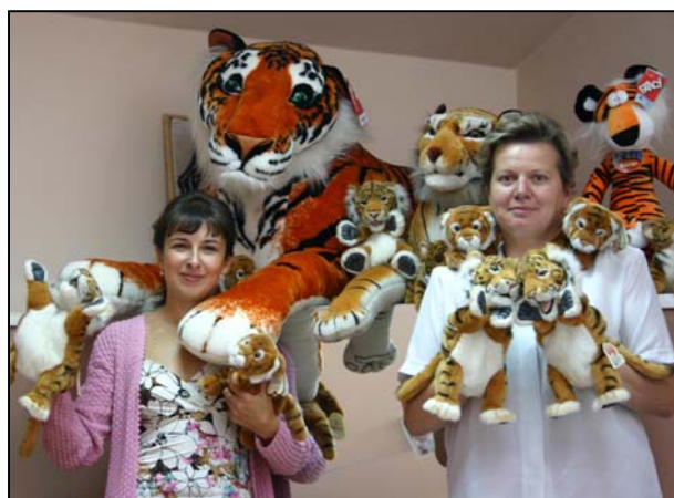
Phoenix staff with fancy tiger toys for awards

This year the holiday has become really international as many events and actions were taken before, during and after International Tiger Day (September 25th) round the world (China, India, Thailand, USA). For example, on the eve of International Tiger Day, Save The Tiger Fund (STF) launched the Campaign Against Tiger Trafficking (CATT) in concert with partners and related events around the world. On the 23 rd of September 2005