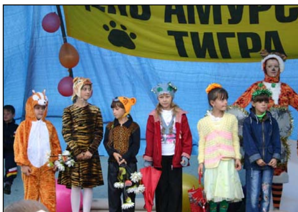
Tiger Day Festival in Luchegorsk city

International Fund for Animal Welfare-Russia (IFAW-Russia) and the Phoenix Fund organized a press conference in Vladivostok, Russian Far East, to inform about the Campaign Against Tiger Trafficking (CATT) and appealed to local authorities and communities to stop killing the world’s big cats and destroying their priceless forest habitats. This information was covered by the local press, radio, and television.