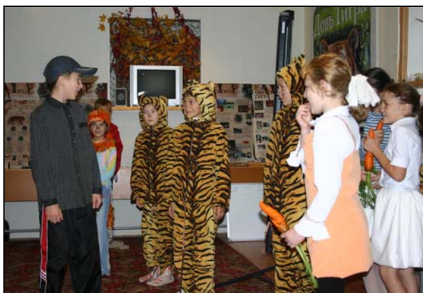
© Phoenix Fund Play "Visiting Primorye"

The premiere of the conservation-oriented play "Visiting Primorye" took place on July 29. About 40 young spectators of 7-14 years old came to watch the play. After the performance the audience discussed the play and told about the unique nature of Primorye, rare and endangered animals, ways and methods of wildlife conservation etc.