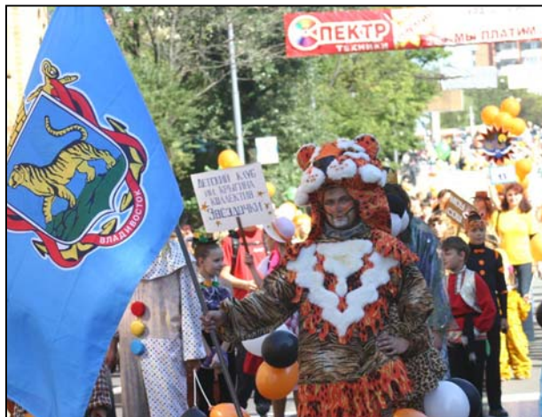
Amur tiger heads the carnival procession in Vladivostok, September 25, 2005

Celebration of the Tiger Day Festival is a wonderful tradition in Vladivostok, Russian Far East. The Festival reminds people about the uniqueness and beauty of the territory they live in. Amur tiger is a symbol of Vladivostok city and Primorsky krai, the animal most respected in the Russian Far East. One of the central Vladivostok streets is called “Tigrovaya” in Russian (“Tiger’s”) and there is a hill with the same name in the city.