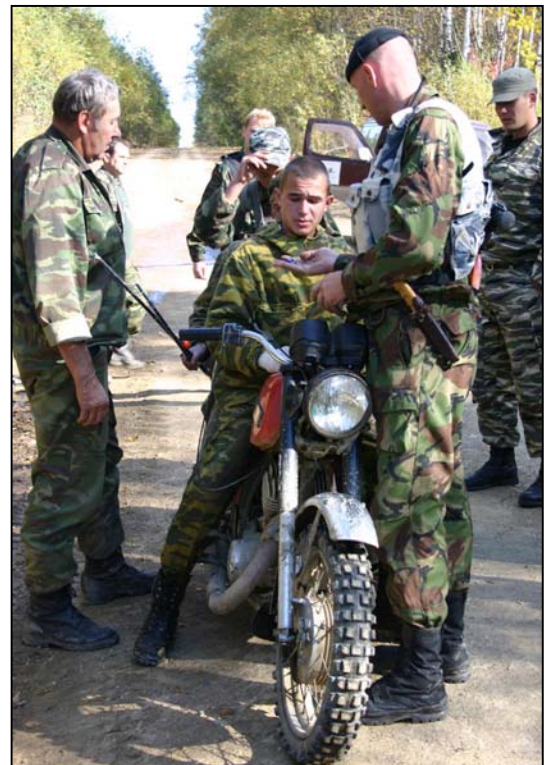
Checking a motorcyclist

In 2005 two public environmental investigation teams continued anti-poaching activities in the north of Primorye. From January 01 through September 30, 2005 public rangers in cooperation with wildlife managers, police officers, forest service staff and Inspection Tiger rangers conducted over 84 patrols in Pozharsky, Krasnoarmeisky and Dalnerechensky districts of Primorye. The raids were focused on conservation of the ungulates habitat as hunting was allowed only during the first month of the year. March and April are the months of a thawing season that leads to occurrence of thin crust of ice on the ground, and as a result, animals often hurt their legs and cannot elude pursuit by dogs and poachers. All patrols were documented and recorded on video camera. For the reported period the team drew up 59 reports on violations of hunting regulations, confiscated 48 illegal rifles, 10 traps and other poaching devices (see Table 2 in Attachment). See the description and results of the project activities' for the period from January 01 to June 30 in the Interim Report.