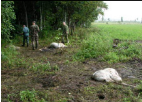
Investigation of tiger attack case

On August 01 – 05, near Nagornoye village, Pozharsky district, a tigress (10 cm paw width) and a cub (8 cm paw width) killed 3 cows that belonged “Luchegorskoye” farm. A cattle-pen was not paled and cows rambled through the forest at night. As a result, tigers attacked cows 4 km far from the buildings at night. After getting this information Inspection Tiger team went to deter the tigers using flares and gunshots. While taking the deterrent measures, the rangers did not find fresh tiger tracks. Local people were instructed on rules for livestock management in tiger habitat. To reduce possibility of tiger attack the workers of agricultural enterprise had to fence their fields to keep the cattle from getting killed by