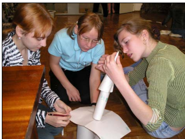
Ecological class in Luchegorsk school

In January 01 - September 30, 2005 over 1,725 schoolchildren attended 55 ecological classes at local schools and eco-centers in Pozharsky district. Two experienced teachers carried out classes as interactive training. See the description and results of the project activities' for the period from January 01 to June 30 in the Interim Report.