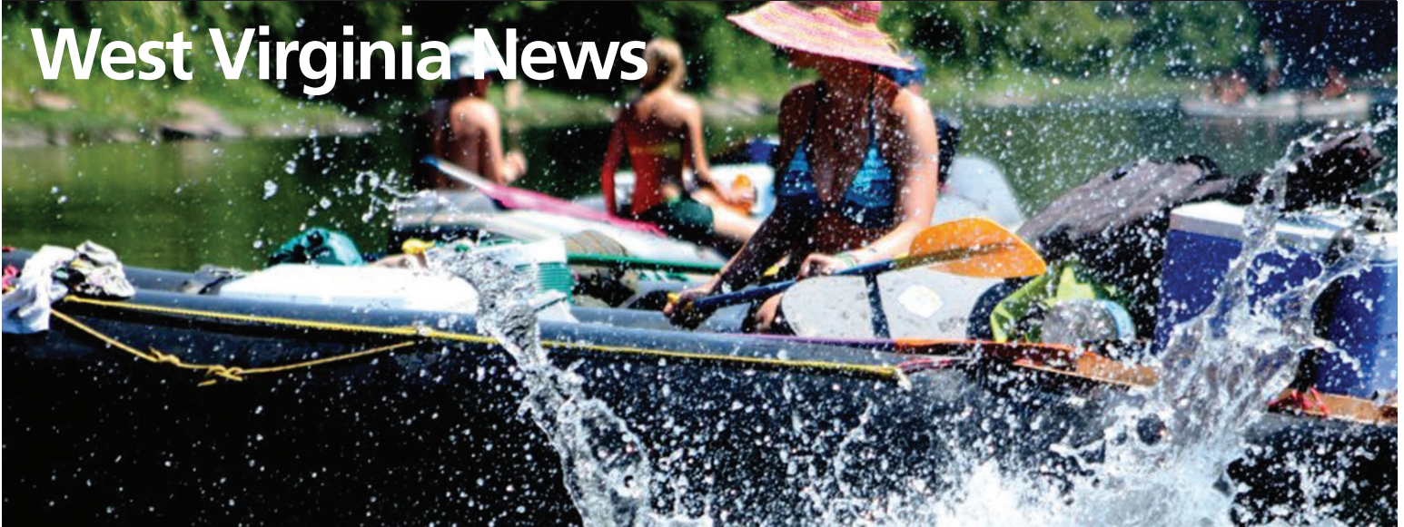
Someone is having way too much fun on the Upper Cheat River Water Trail!