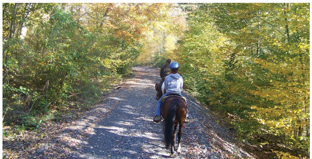
The undeveloped Meadow River Rail-Trail is fine for horseback riding, and affords great views of the river.

RTCA staff participated as a member of Harpers Ferry National Historic Park's Alternative Transportation Study, representing interests and ideas connected with community-park trail connections. RTCA also planned a series of walks with community stakeholders to scope potential loops for the Eastern Panhandle Recreational Trail with community stakeholders. As a result, Harpers Ferry NHP, the Eastern Panhandle Trailblazers, and other community stakeholders are working to create phased trail enhancements.