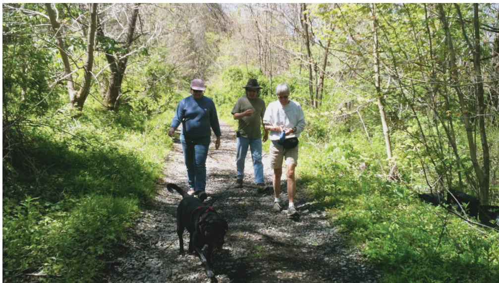
Walkers enjoy the Kingwood Northern Rail-Trail corridor during a Preston Rambles hike.

Facilitate stakeholder and partner involvement, build community support, and develop organizational capacity building.