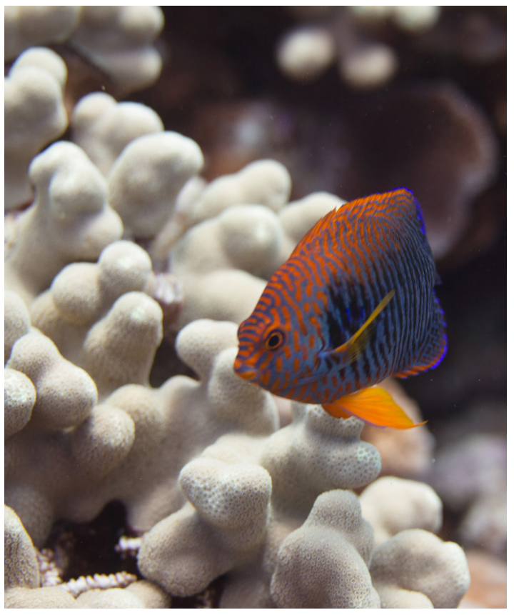
Potter's Angelfish on Hawaiian coral reef

Locate and remove debris from the reefs and adjacent shorelines along the north and east shores of Kauai associated with lost drift nets and derelict fishing gear and from washouts caused by two major flooding events in 2018. Project will survey and clear debris from nine priority sites in cooperation with the Division of Aquatic Resources.