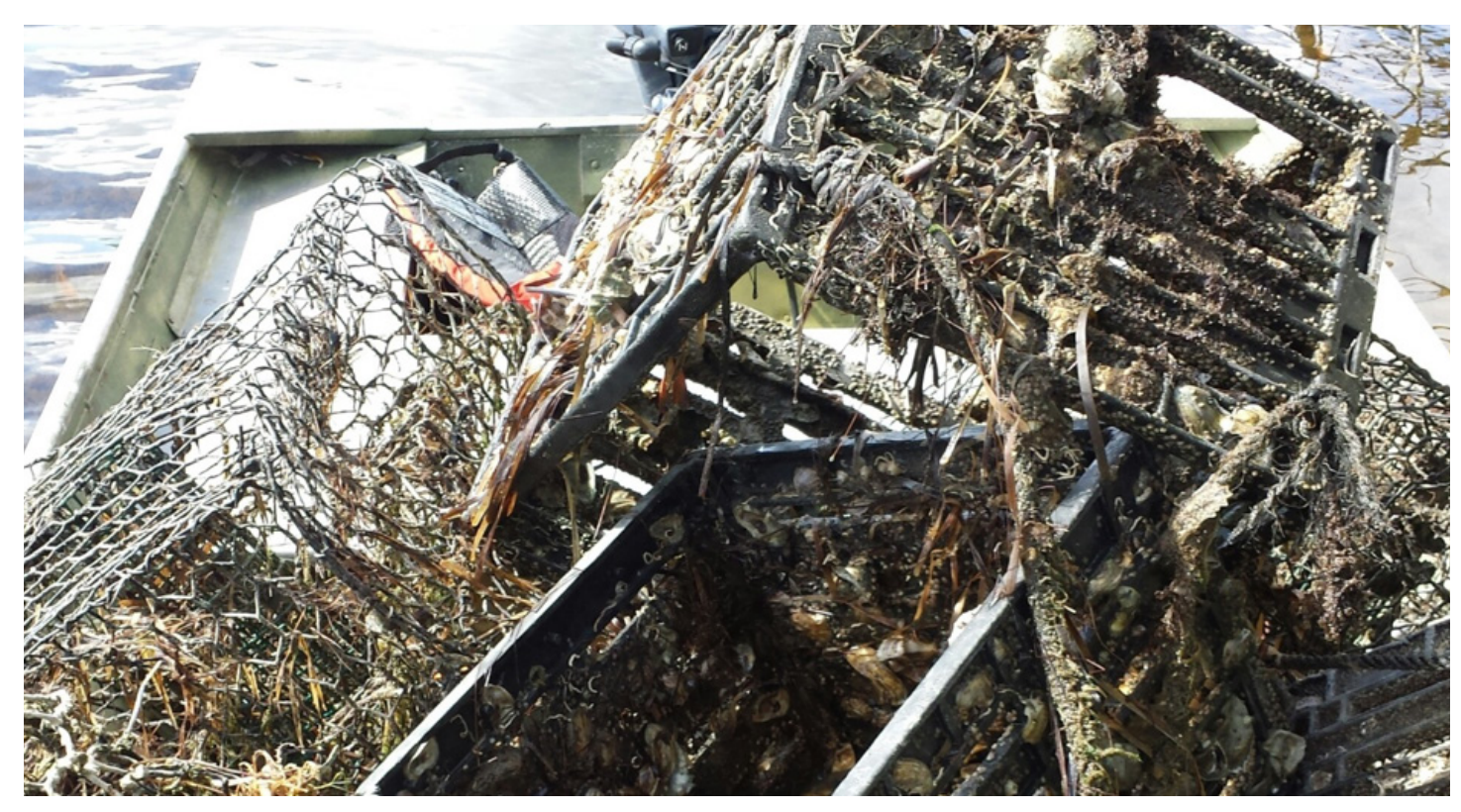
Derelict gear collected through the Fishing for Energy program