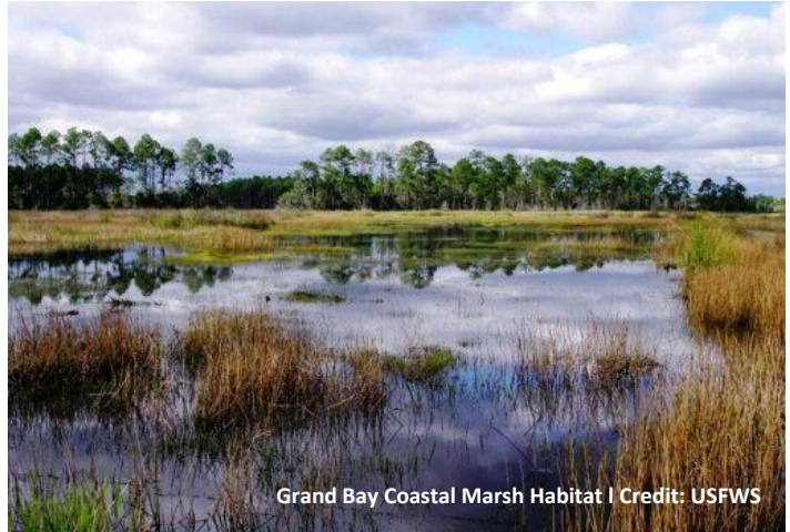
Grand Bay Coastal Marsh Habitat

The lands targeted in this proposal will be managed consistent with goals and objectives in place for existing adjacent protected and managed areas; including 6,500 acres in the state's Forever Wild Program in Grand Bay and Mississippi Sound. The acquisitions also complement the conservation benefits provided by the Grand Bay National Wildlife Refuge and overlapping Grand Bay National Estuarine Research Reserve, which protect nearly 18,400 acres of relatively undisturbed coastal wetlands and wildlife habitats to the west of the project area. The proposed acquisitions are critical inholdings in the Grand Bay complex and represent significant outstanding properties linking existing conservation lands across the broader Mississippi Sound landscape in the northern Gulf of Mexico. The project will restore the adjacent upland buffers through the control of invasive species, boundary posting and prescribed fire to enhance ecological function and resiliency.