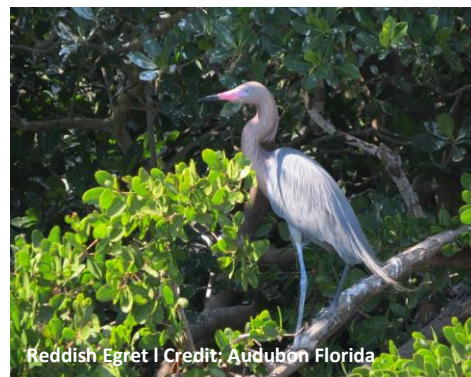
Reddish Egret

This project represents the first phase of a comprehensive watershed conservation initiative that seeks to maintain and enhance the ecological function of Turkey Creek, one of the primary tributaries to the Back Bay of Biloxi. A watershed action plan has been previously developed for Turkey Creek, and restoration activities enjoy strong community support.