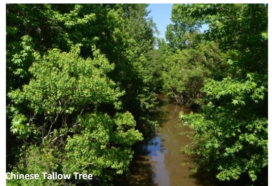
Chinese Tallow Tree