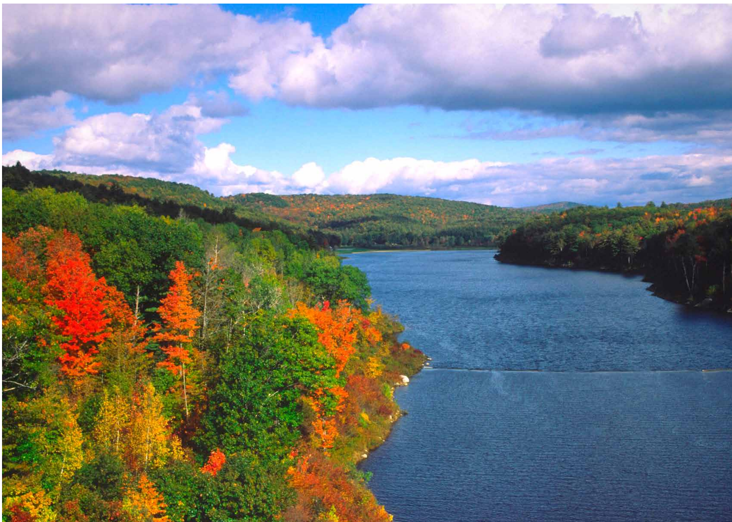
Connecticut River in southern New England