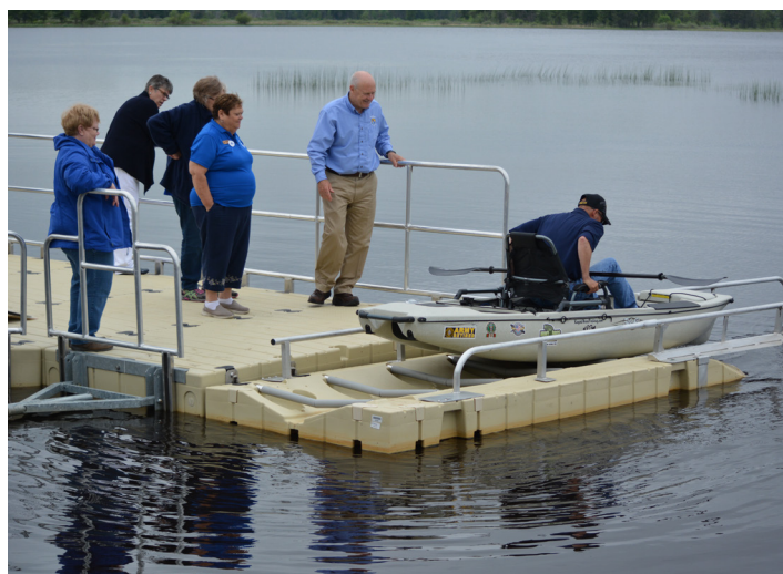
Necedah NWR fishing and ADA kayak launch