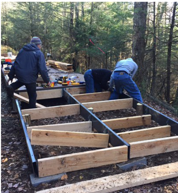
Salamander overpass and boardwalk construction by Friends of the 500th