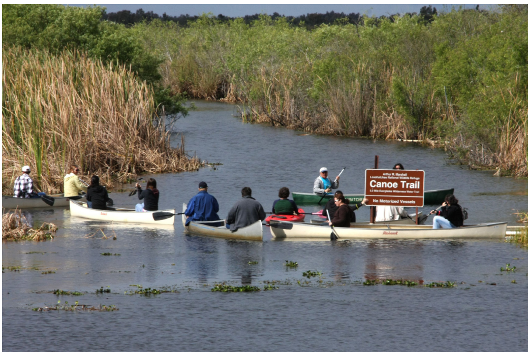
Friends of Loxahatchee NWR lead a canoe tour of the refuge.