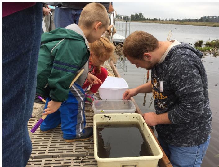
Educational programs at Sherburne NWR wetlands dock

Grantee:..... International Wildlife Refuge Alliance NFWF Award Amount: .....$10,862 The International Wildlife Refuge Alliance and its partners will construct a handicap accessible kayak launch on the Detroit River International Wildlife Refuge, next to the new John D. Dingell Visitor Center. Over 100,000 visitors are expected to visit the site annually. This launch will provide new recreational opportunities, including hunting and fishing.