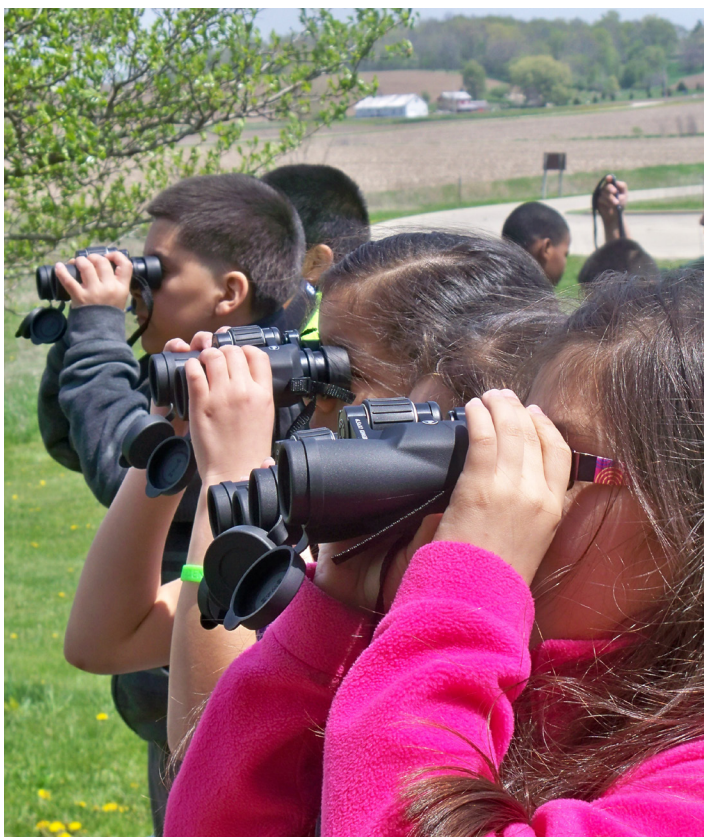
Birdwatching education program with Friends of Horicon NWR

Special Initiatives: Grants in this category give the program flexibility to meet the needs of changing priorities of the Refuge System and help engage Friends in those changes. For example, the program offered a special birding initiative when there was a need to support educational programming that focused on birds. Currently, there is a special hunt/fish/access initiative to help engage Friends in supporting their refuge's goals of improving or expanding hunting and fishing programming as well as supporting projects that increase public access.