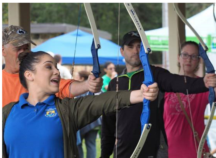
Youth archery program at John Heinz NWR