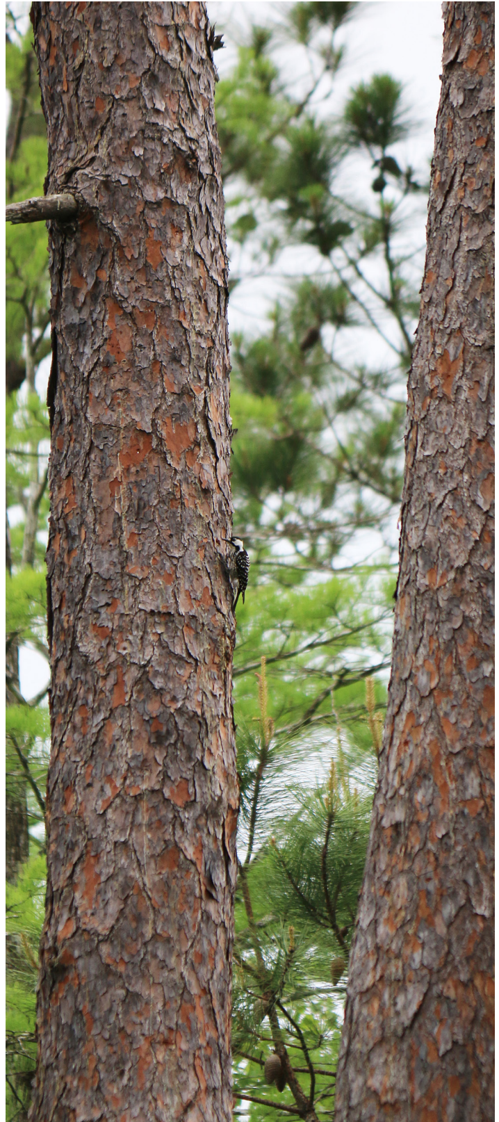
A red-cockaded woodpecker hunts for insects on the trunk of a mature longleaf pine. The birds, which evolved to rely on the longleaf pine, are an endangered species.

The grants are administered by NFWF’s Longleaf Stewardship Fund, a landmark public-private partnership that includes the U.S. Department of Agriculture’s Forest Service and Natural Resources Conservation Service, the U.S. Department of Defense, the U.S. Fish and Wildlife Service, and private funding from Southern Company, International Paper’s Forestland Stewards Initiative and Altria Group. The fund, now in its fifth year, combines the financial and technical resources of the partnership to accelerate restoration of the longleaf pine ecosystem and implementation of the Range-Wide Conservation Plan for Longleaf Pine as part of America’s Longleaf Restoration Initiative. 🐟