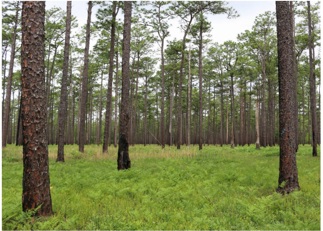
Open and sunny, healthy longleaf forests feature a park-like aesthetic.

1133 15th Street, NW Suite 1100 Washington, DC 20005 202-857-0166