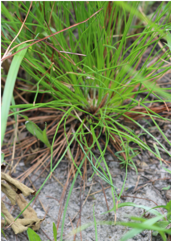
Longleaf pines begin their long lives in a “grass stage” on the forest floor.

Such predictive power arises from pixel-to-pixel analysis of canopy reflective values, tree density, tree shadows, understory and a host of other factors. To do all this without the use of supercomputers – Anderson’s team uses stock laptops and desktops – the researchers use methods that leverage the latest developments in parallel processing and function modeling and a coding library and suite of software developed by RMRS biological scientist and team member John Hogland. Their methods, which involved writing more than 100,000 lines of code and juggling 15 terabyte datasets, can even offer confidence intervals for model predictions, which allow evaluation of their uncertainty and accuracy. This new set of tools can predict, for example, with 80 percent confidence that a given section of forest contains longleaf pine trees with a diameter greater than 20 inches.