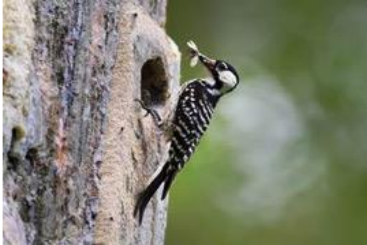
The Red-cockaded Woodpecker’s habitat –longleaf pines in the Southeast—was once shaped by the region’s frequent lightning fires. The species was listed as Endangered in 1970 after drastic decline of original habitat.

Priorities will include planting longleaf pine in areas chosen for restoration through science-based planning and enhancing existing longleaf forest habitat with prescribed burning. Other activities will include thinning and invasive species removal.