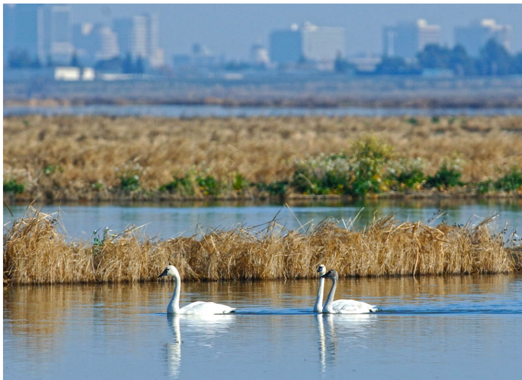
Tundra swans paddle through a marsh near Sacramento, California.